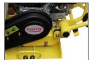
New low hand/arm vibration