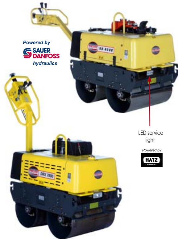
LED service light